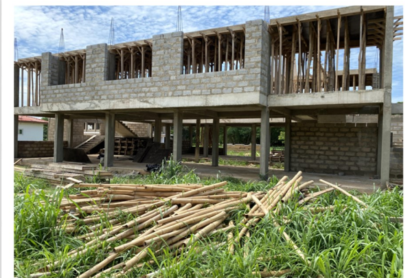
Picture 5-[The Current State: Flooring of the Ground Floor & Setting of the 1st Floor Completed. The metal works and construction of the 1 st Floor remain outstanding]