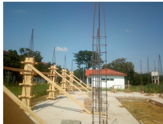
Picture 3- [Casting of Foundation Overhead Concrete and Pillars on the Ground Floor]